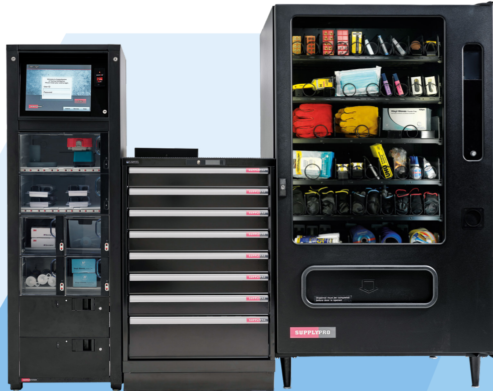
SupplyBay as an auxiliary unit

SupplyBay is the solution for vending with absolute control in the harsh industrial environment. Featuring integrated touchscreen control and state of the art electronics, SupplyBay delivers the reliability your supply chain needs.