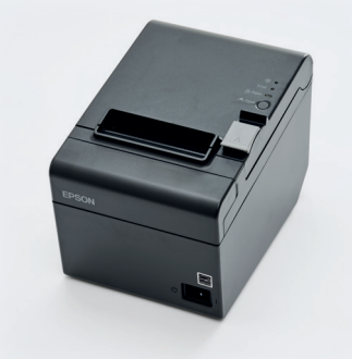
Issue a customised pick receipt with Tooling Intelligence's exclusive VIM Printer option.