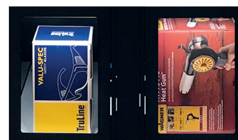
Bottom 2 Storage Compartments 13.25"w x 15.45"h